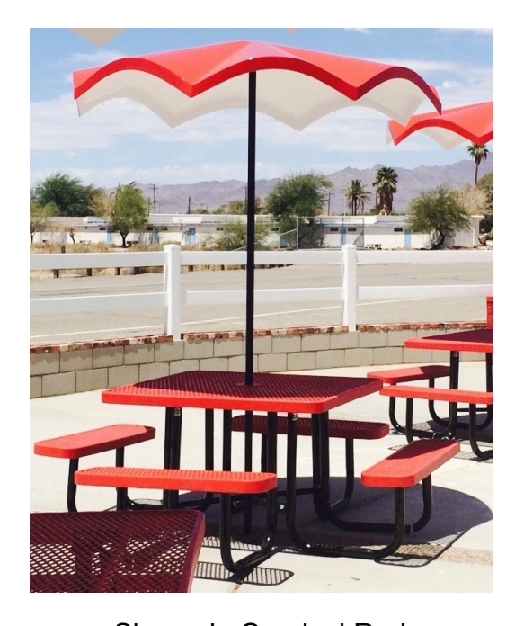
Shown in Carnival Red